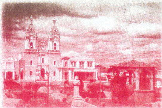
San Francisco de Asis Jalisco, Mexico

6331 PEACHTREE INDUSTRIAL BLVD. DORAVILLE GA 30360