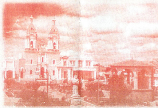
San Francisco de Asis Jalisco, Mexico