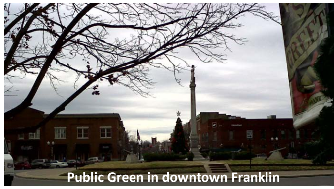
Public Green in downtown Franklin