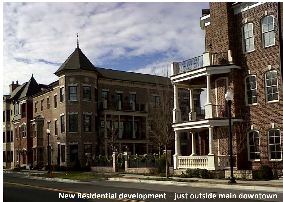
New Residential development – just outside main downtown