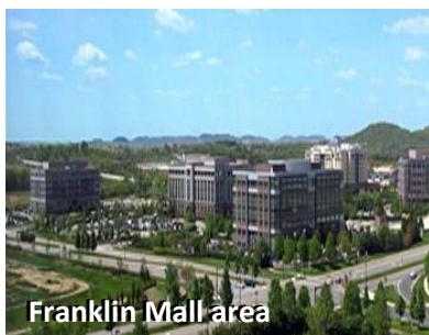
Franklin Mall area