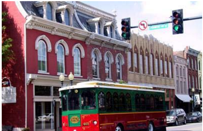
Franklin Trolley – connecting downtown and mall