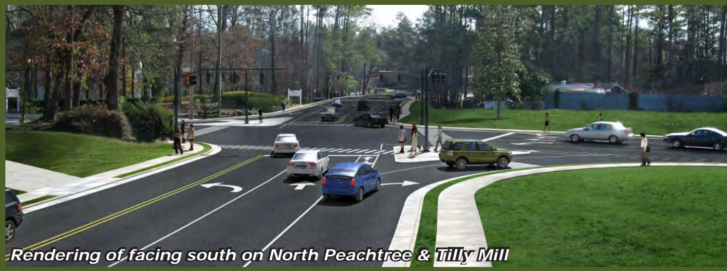
Rendering of facing south on North Peachtree & Tilly Mill