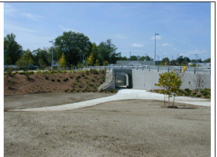
WMU Pedestrian Underpass (The CSM Group)