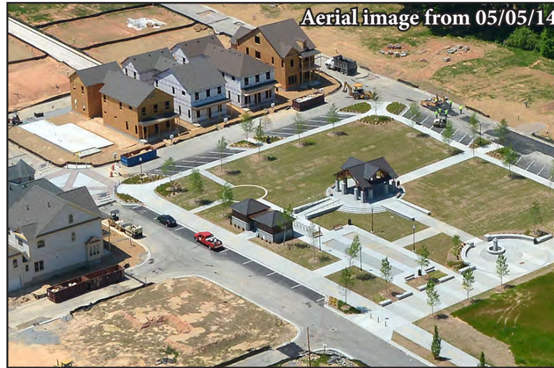
Join us for the Grand Opening: Georgetown Park Fest on Saturday, May 17, 2014 from 11 a.m. to 3 p.m.