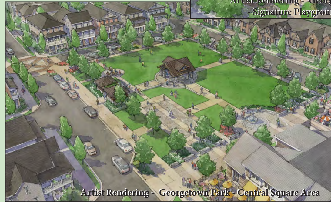
Artist Rendering - Georgetown Park - Central Square Area