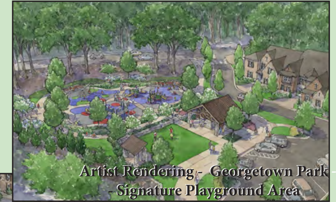
Artist Rendering - Georgetown Park - Signature Playground Area