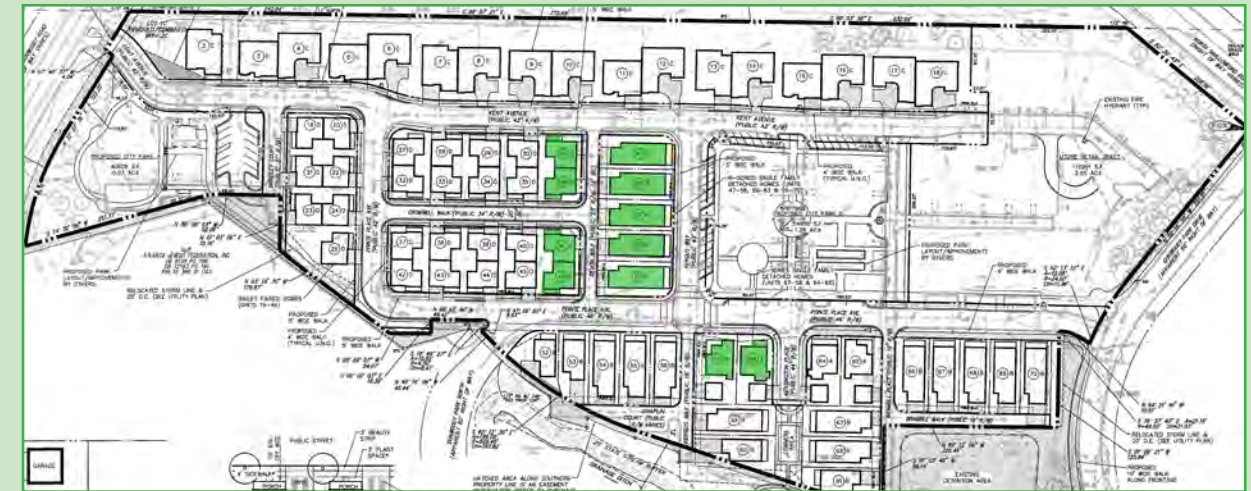
Lots shown in green have been sold to JWC Loden, LLC - the seven surrounding the central square are in various stages of construction