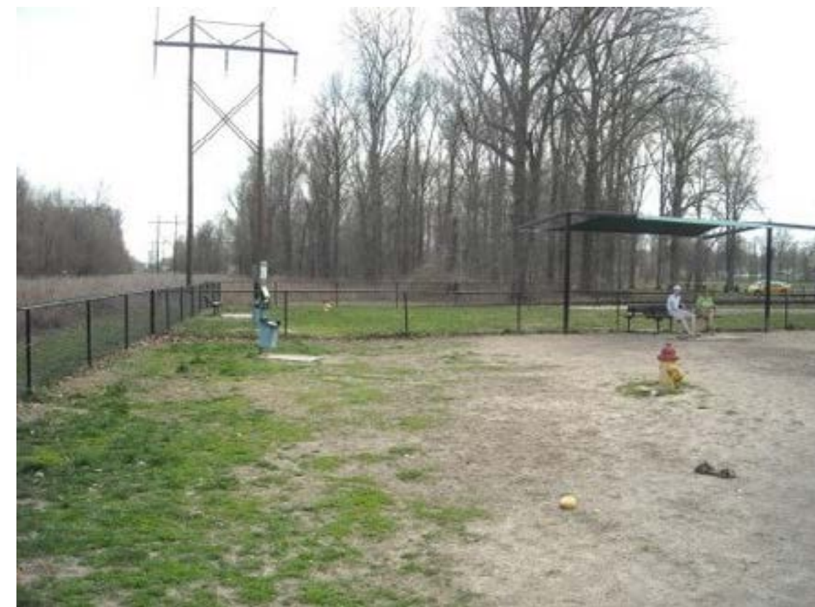
1. Dog Park Under Powerline