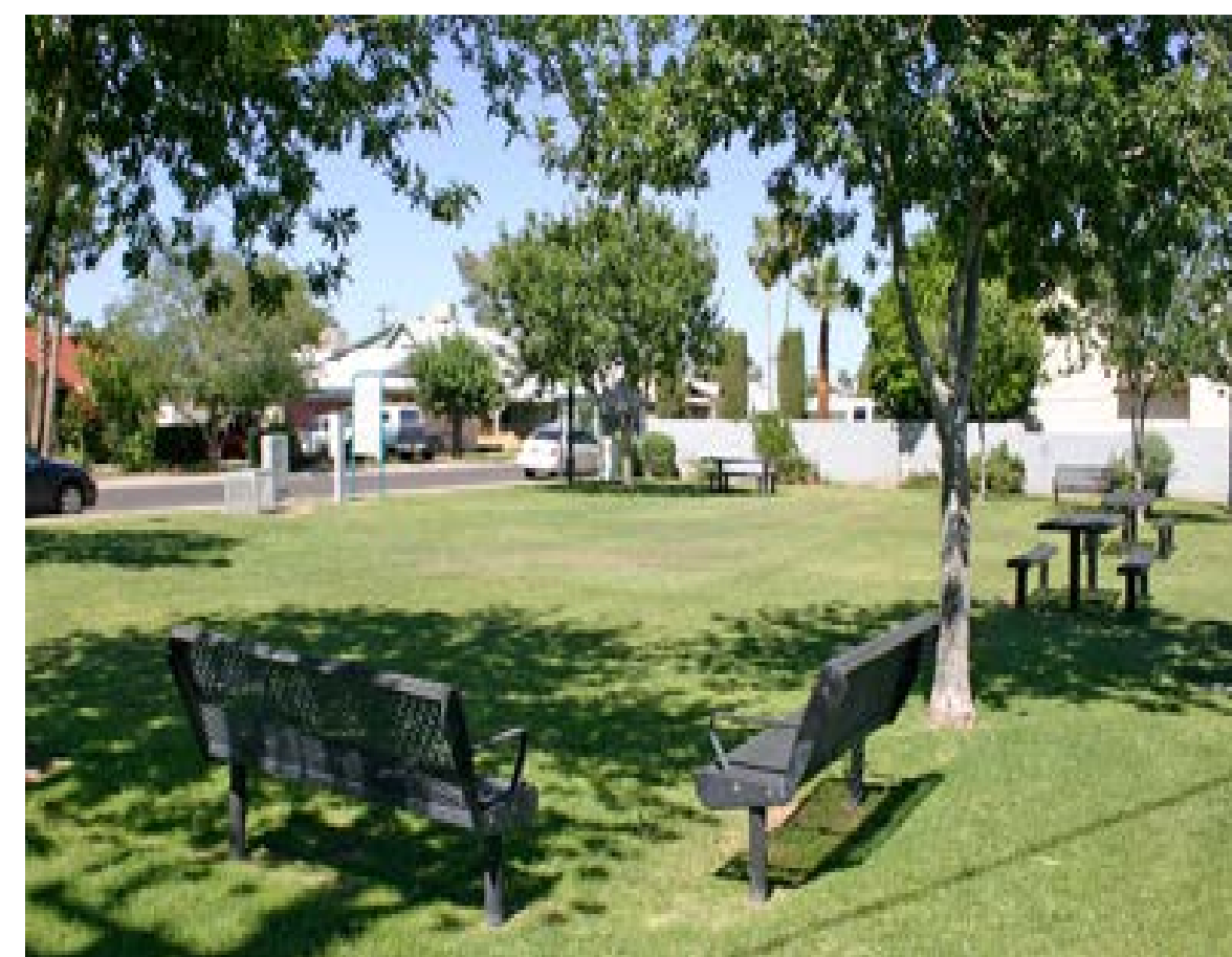
2. Open Lawn Park