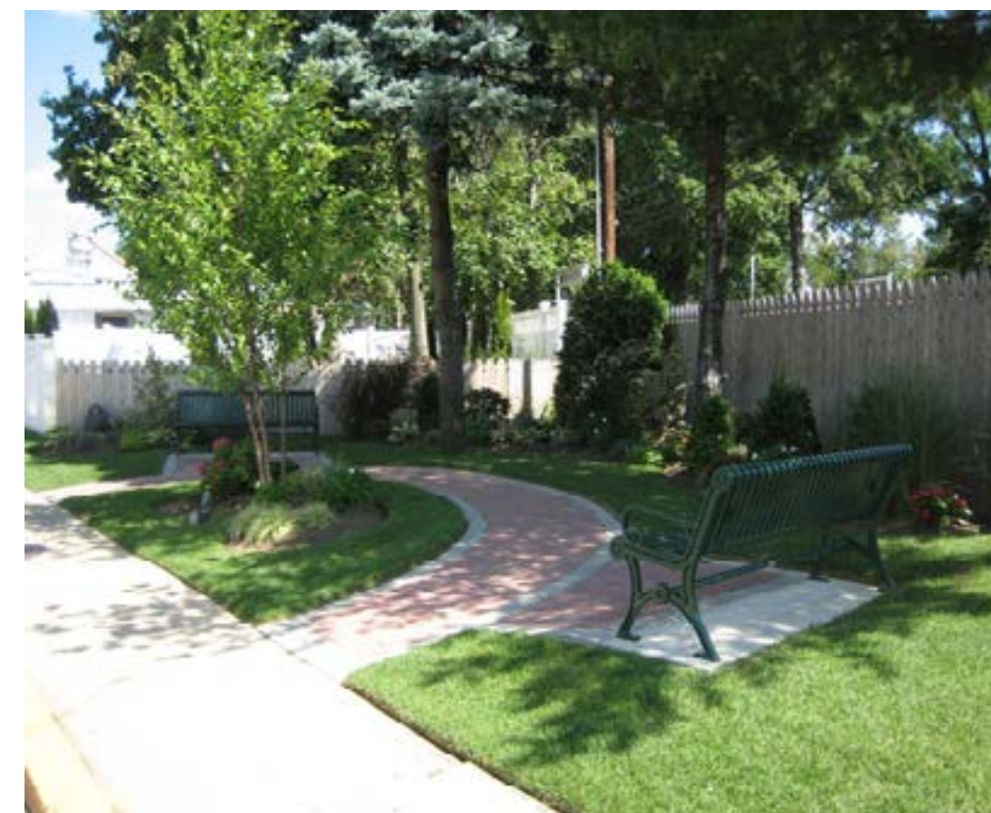
3. Intimate Park