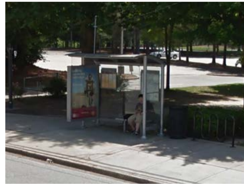
1. Existing-City of Dunwoody