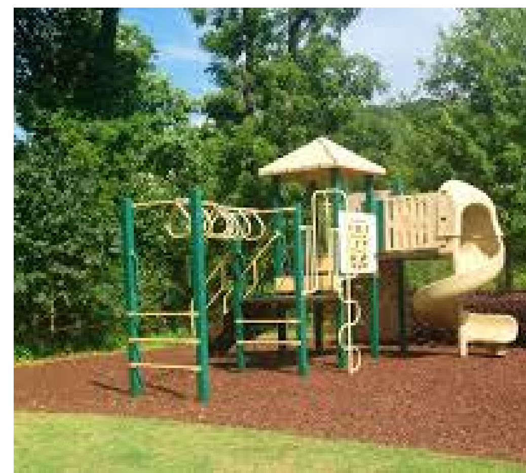
4. Tot Lot