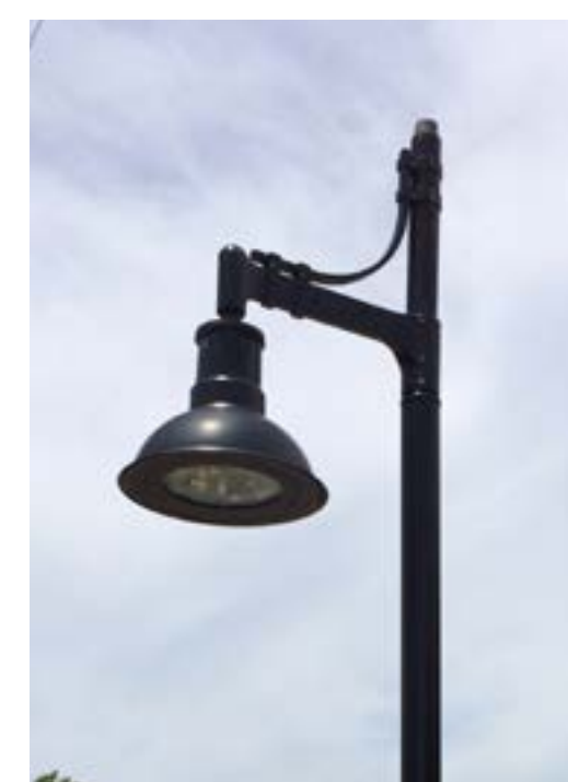
4. American Industrial