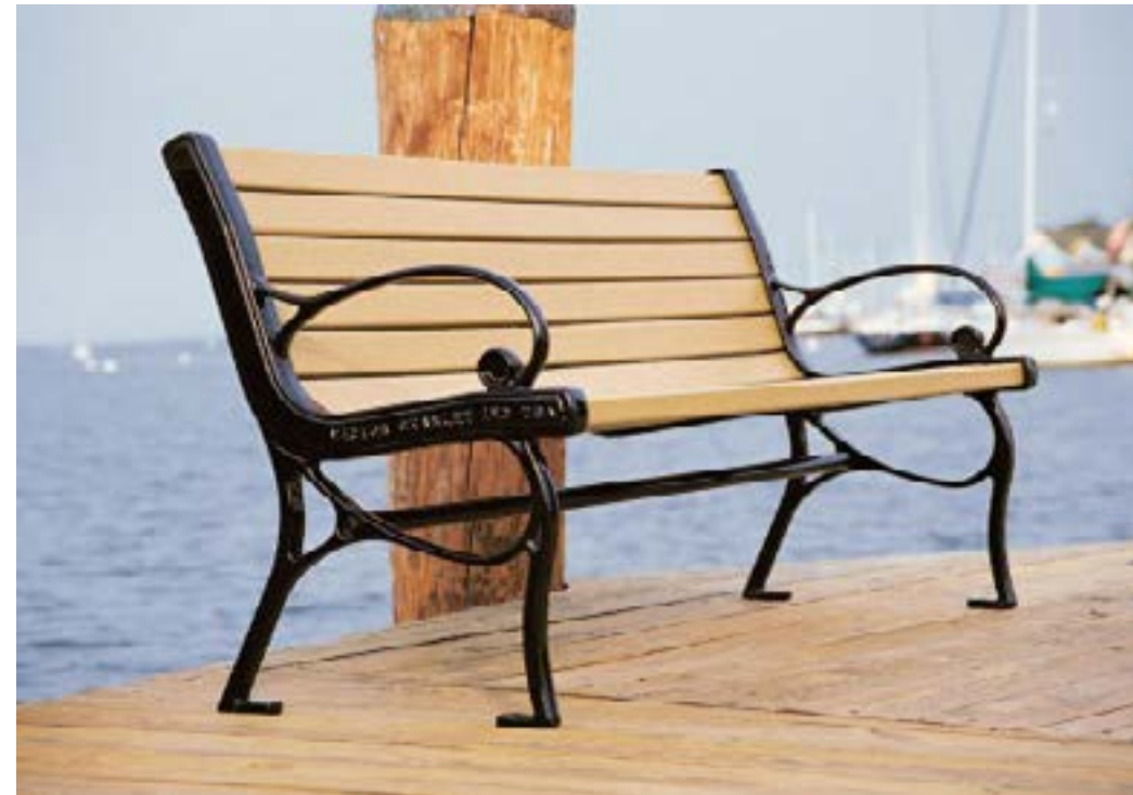
1. Dunwoody Traditional Standard Metal