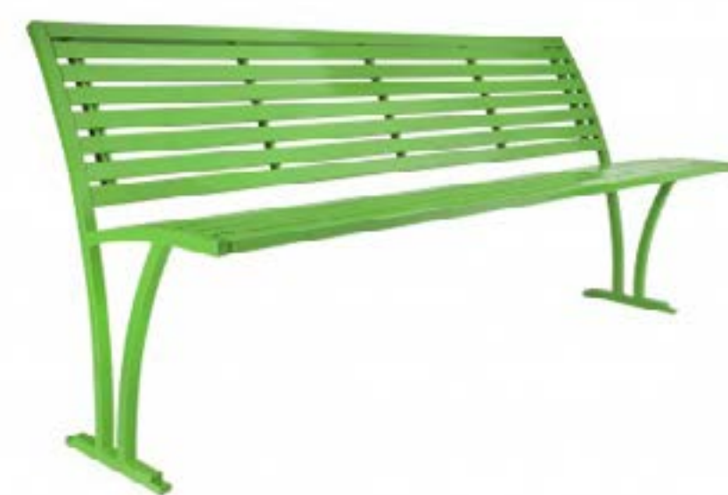
3. Contemporary Metal Option