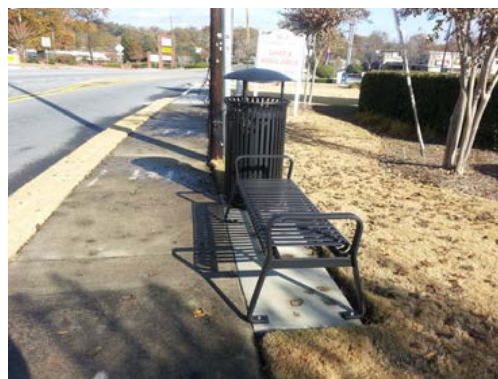
2. Backless Traditional