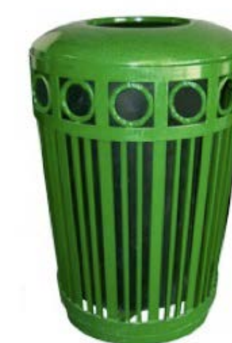
3. Contemporary Metal Option