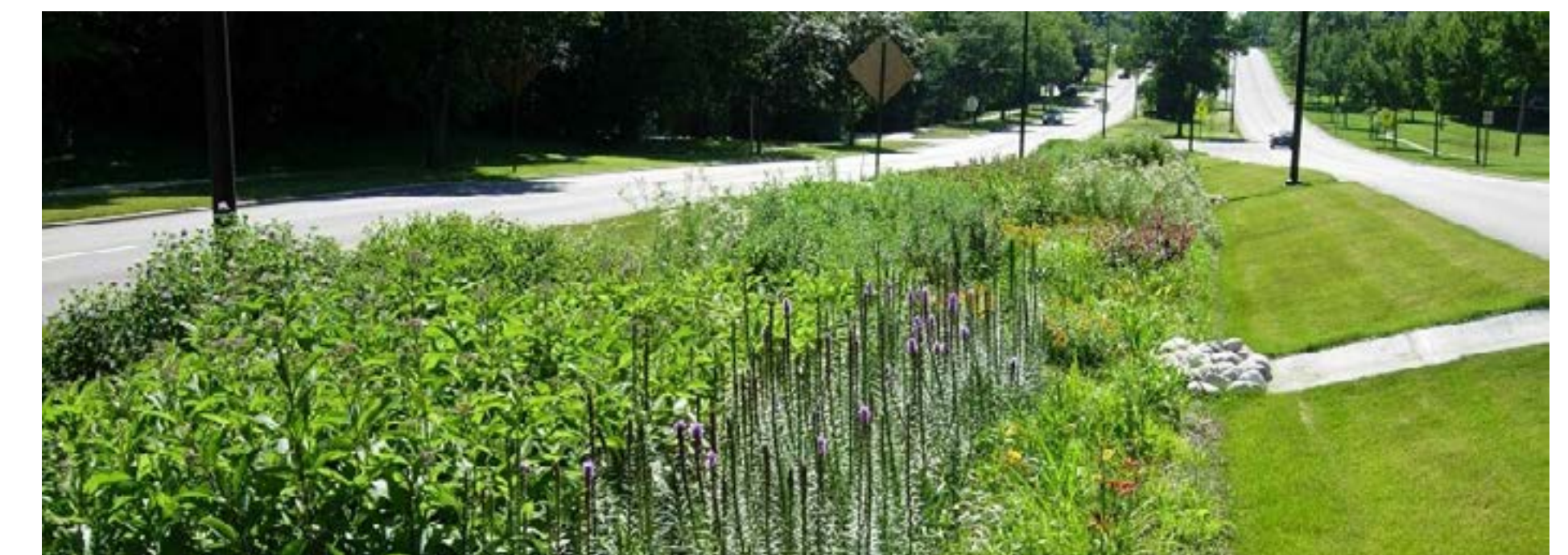
2. Bioretention Area Between Roadways