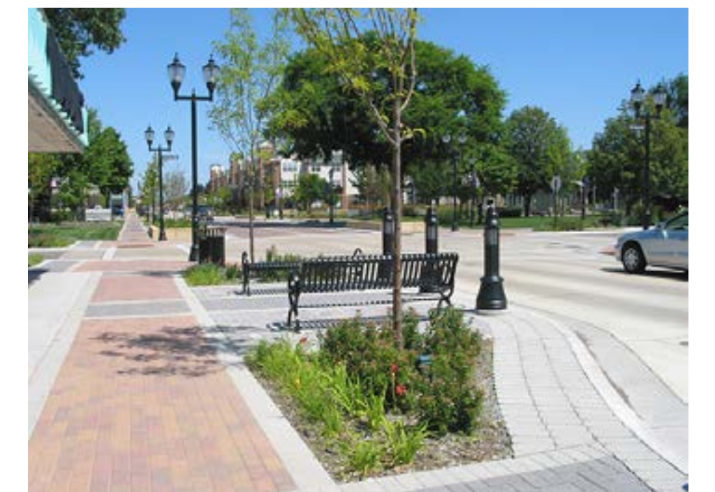
2. Seating Separated From Walkway and Special Accent Paving