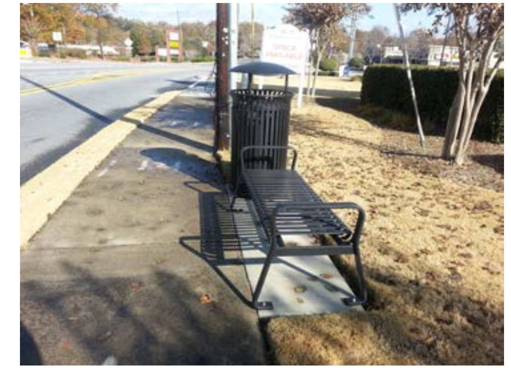
1. Current Standard