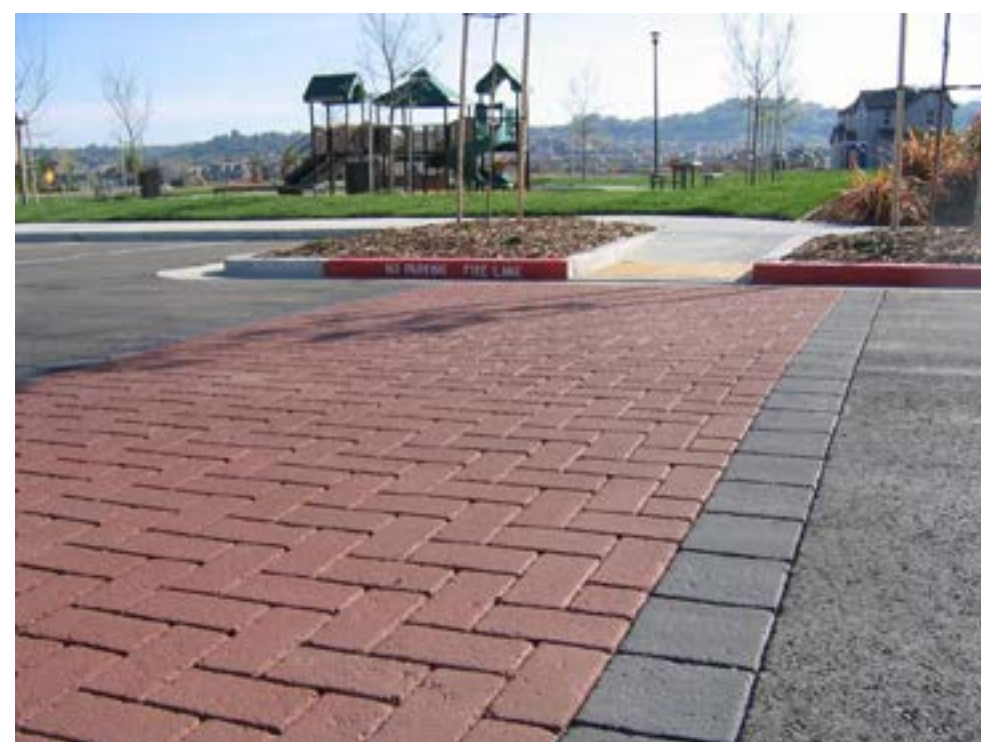
2. Stamped Asphalt