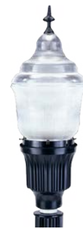
2. Traditional Acorn