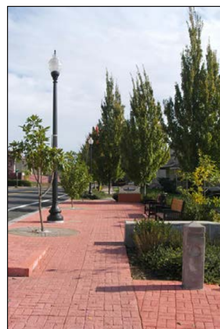
5. Streetscape Park