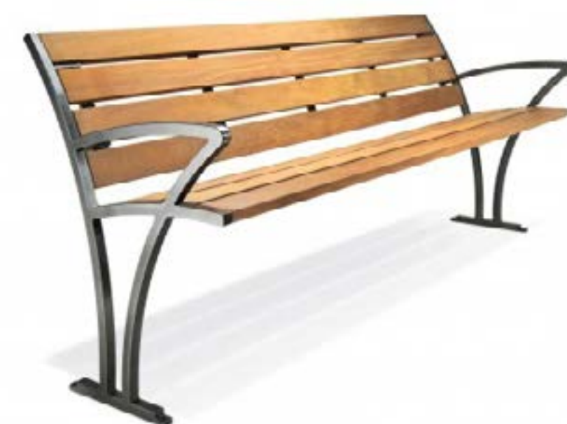
4. Contemporary Wood or Composite Option