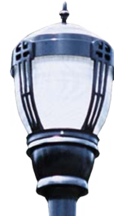
1. Dunwoody Village Standard