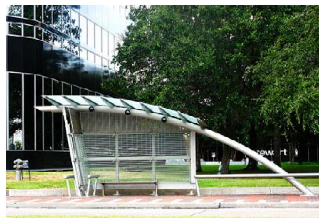
4. Unique/ Custom