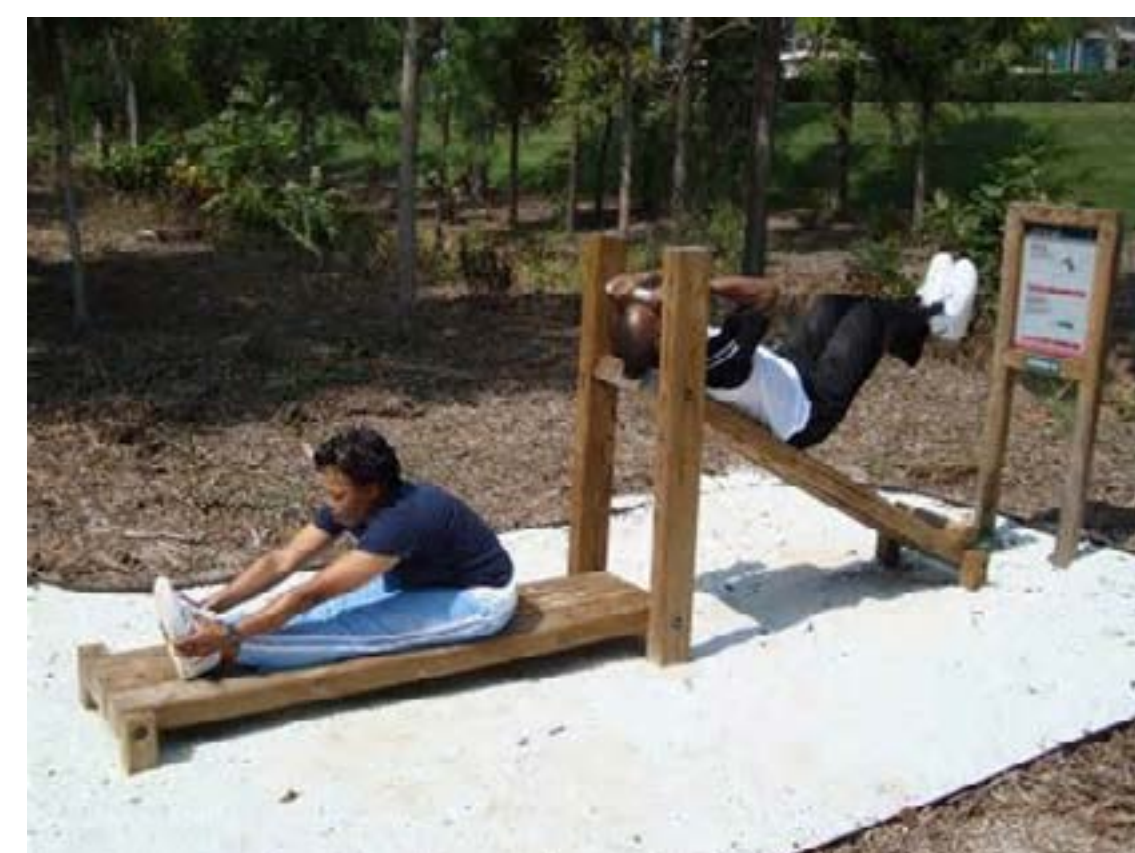
6. Fitness Trail