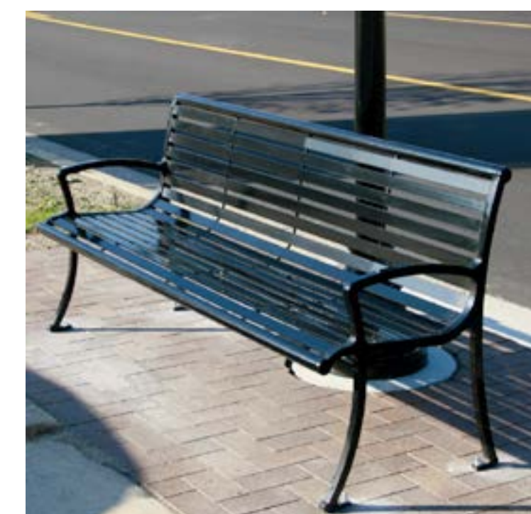
3. Simple Accented Paving