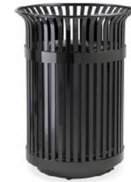
1. Traditional/ Current