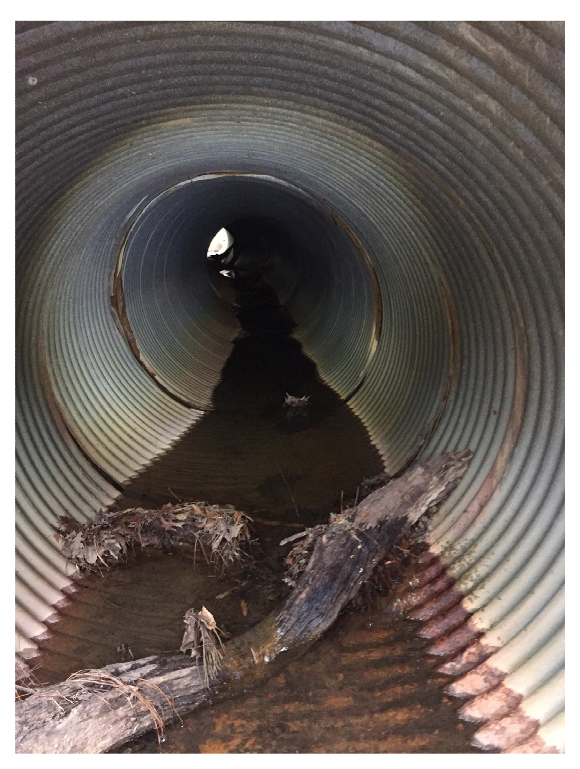
Invert Failure and Poor Alingment Throughout Pipe