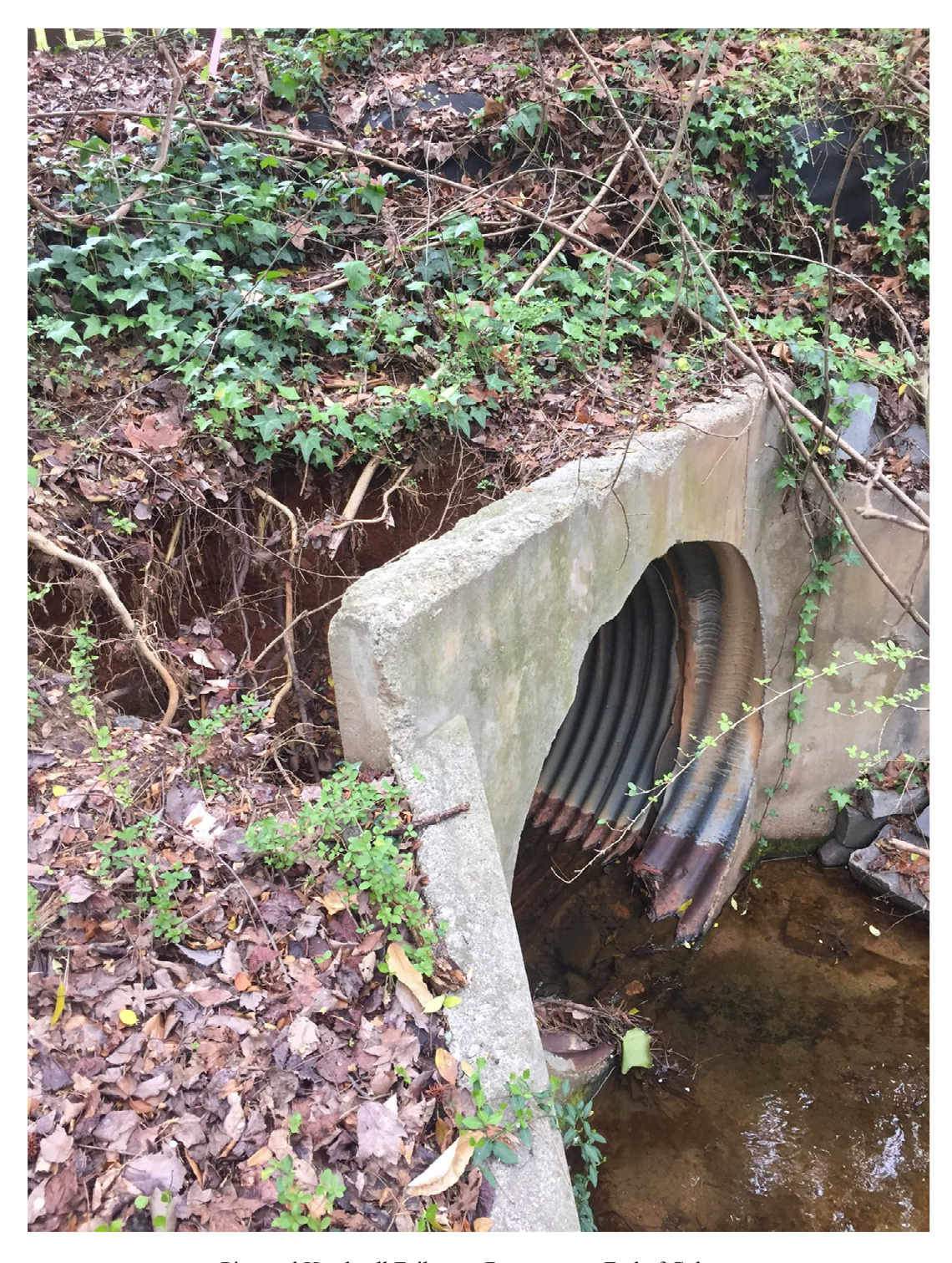
Pipe and Headwall Failure at Downstream End of Culvert