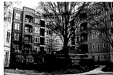
▲ Housing in Perimeter Center