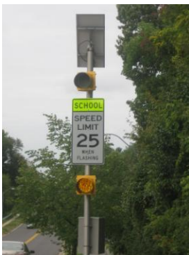
Figure 2. Example of school speed limit sign.

Generally, the reduced school speed limit zones should be in effect only during specified intervals such as at the start and end of a school day. While the transportation agency responsible for the roadway operations and maintenance installs the signs, the times are generally set through consulting with the local school district. Close cooperation is needed between school officials and those who operate the roadway.