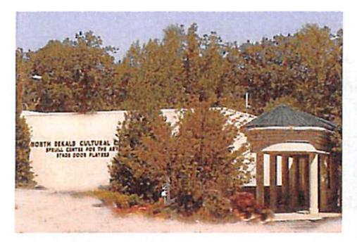
Education Center Exterior Front