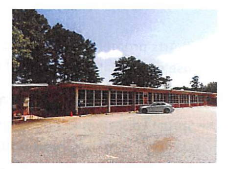
Education Center Rear Classroom Wing