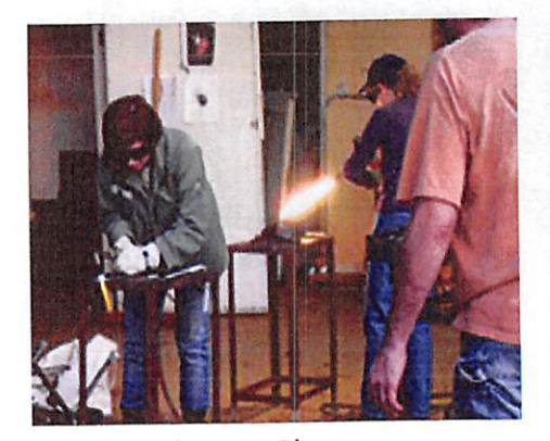
Metal Sculpture Class