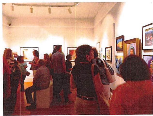
An opening reception at the Spruill Gallery