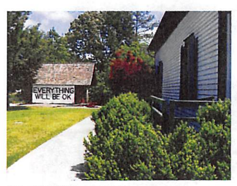
"EVERYTHING WILL BE OK" Mural at the Spruill Gallery