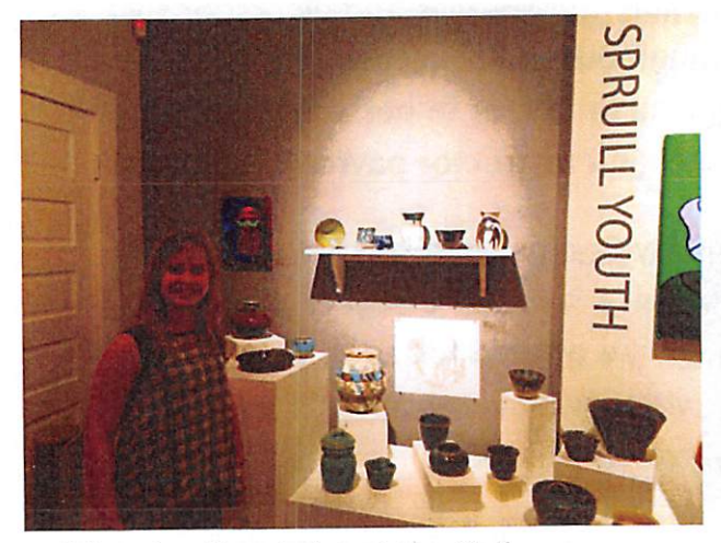
Celebrating Youth Art at the Gallery

The gallery also operates a year-round gift shop. It features artist-made gifts at very attractive price-points. During the Holiday Artists Market, the entire gallery becomes a gift shop containing works by about 100 artists and craftspeople.