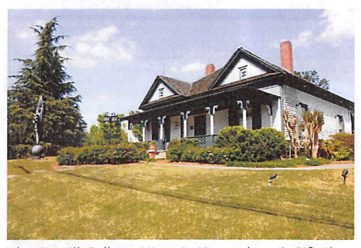
The Spruill Gallery, Historic Homeplace & Gift Shop