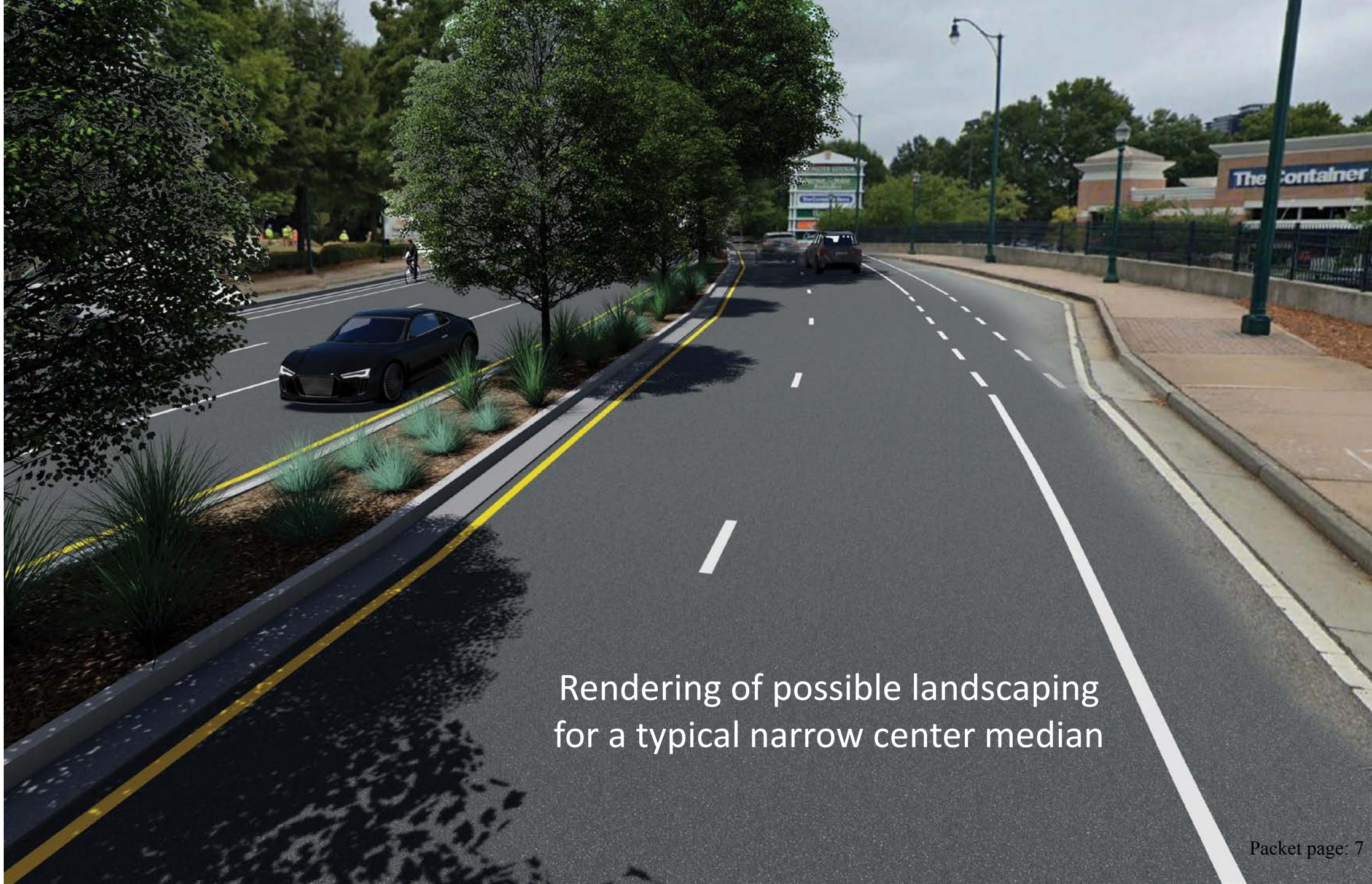
Rendering of possible landscaping for a typical narrow center median