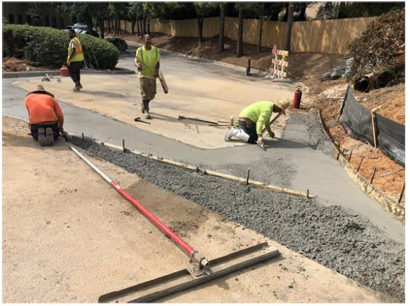
Driveway Replacement North

Reconstruction - Allied Paving removed old pavement and mixed cement into the soil subgrade. Paving is scheduled to begin the week of 9/28.