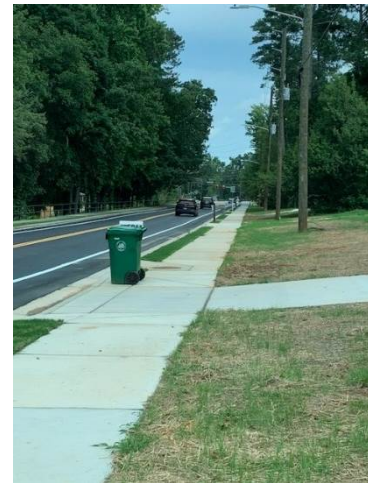
Tilly Mill Sidewalk