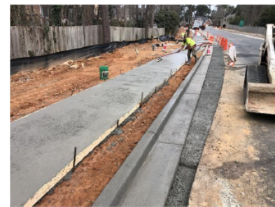
Spalding Drive Sidewalk