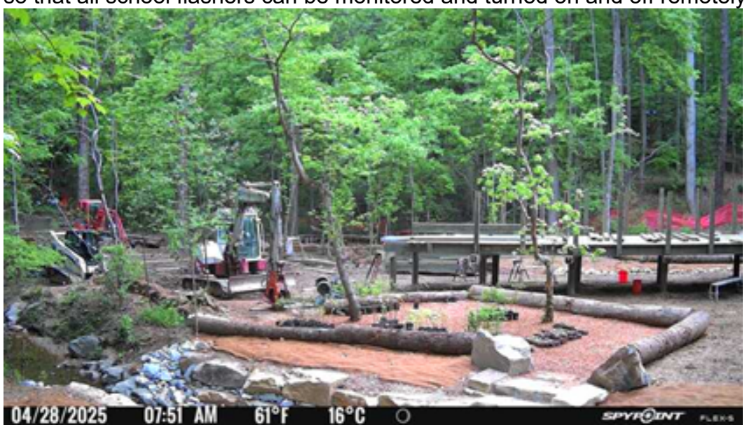
Nature Center Wetland and Boardwalk Construction