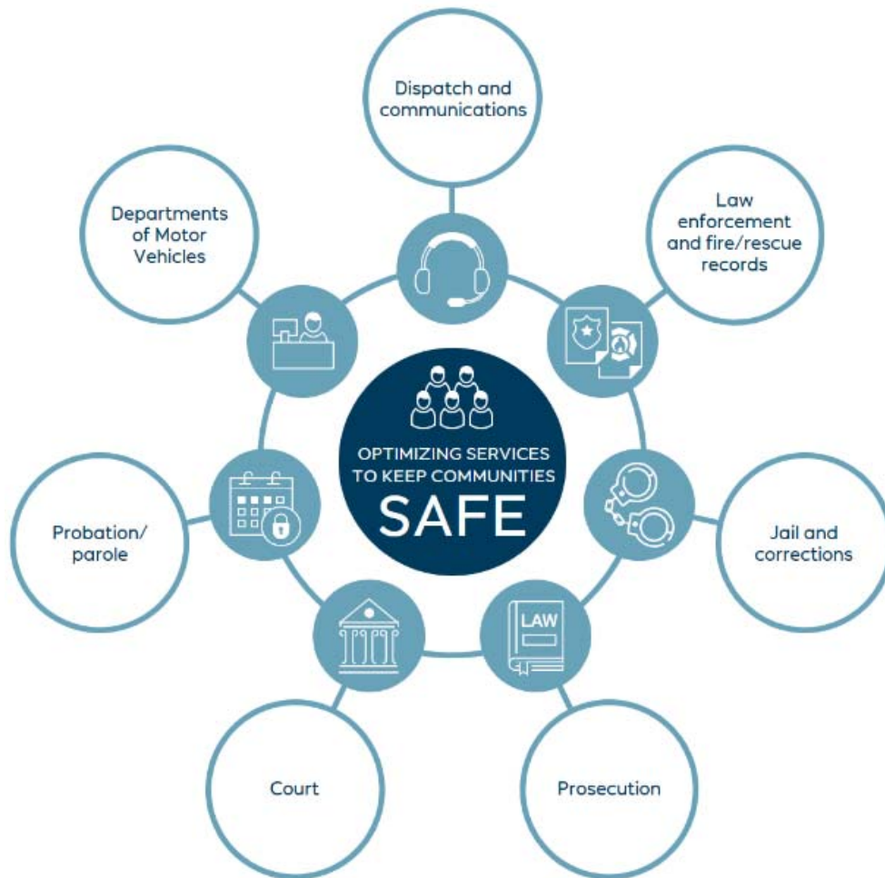
Figure 1: Justice and Public Safety Breadth and Depth of Expertise

This multifaceted understanding is a crucial part of the City’s project, as it seeks recommendations for managing working relationships with other City departments such as the City Attorney’s Office, the Prosecutor’s Office, Jail, Records, and Dispatch and Communications (noted in Section 1.2 of the RFP). On the following page, we provide further description of our experience as it specifically relates to the City’s scope of work.