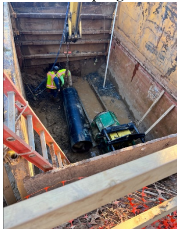
Spalding Drive Bore Pit