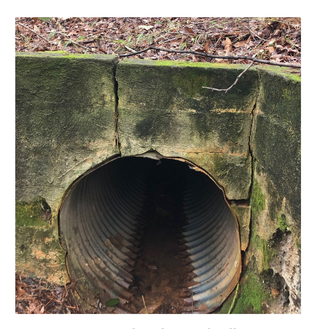
Damaged Outlet Headwall