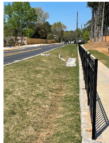
Winters Chapel Trail