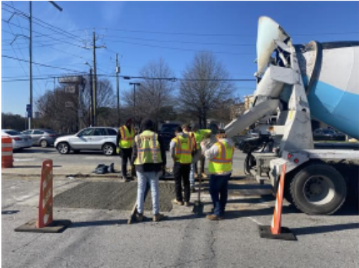
Georgetown Gateway Concrete Cap over Old Water Main