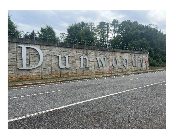
Dunwoody Sign- Perimeter Center Parkway

• October – Paving in the Perimeter area on Perimeter Center West, Perimeter Center Parkway and the south end of Ashford Dunwoody Road.