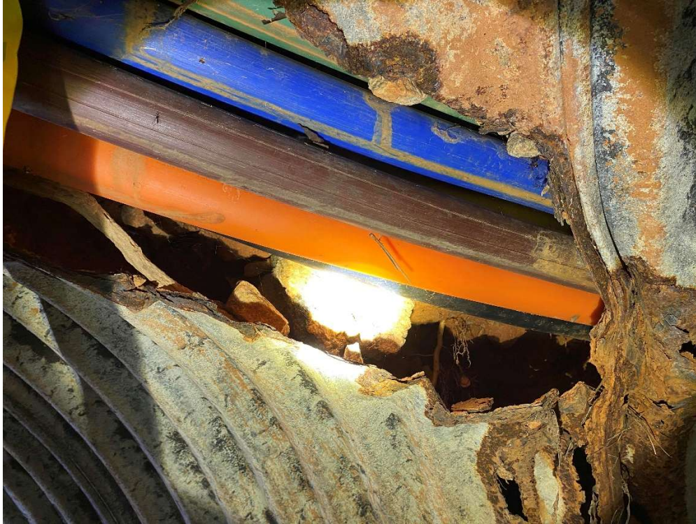
Damage to pipe by other utilities. Large holes and voids, support of Right-of-Way compromised.