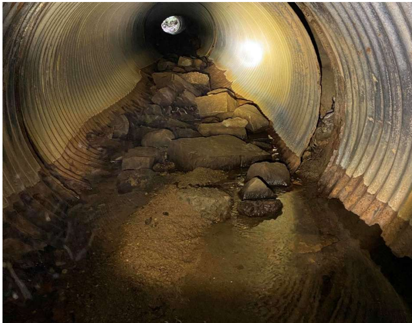
Missing invert and exposed soils in pipe under roadway.